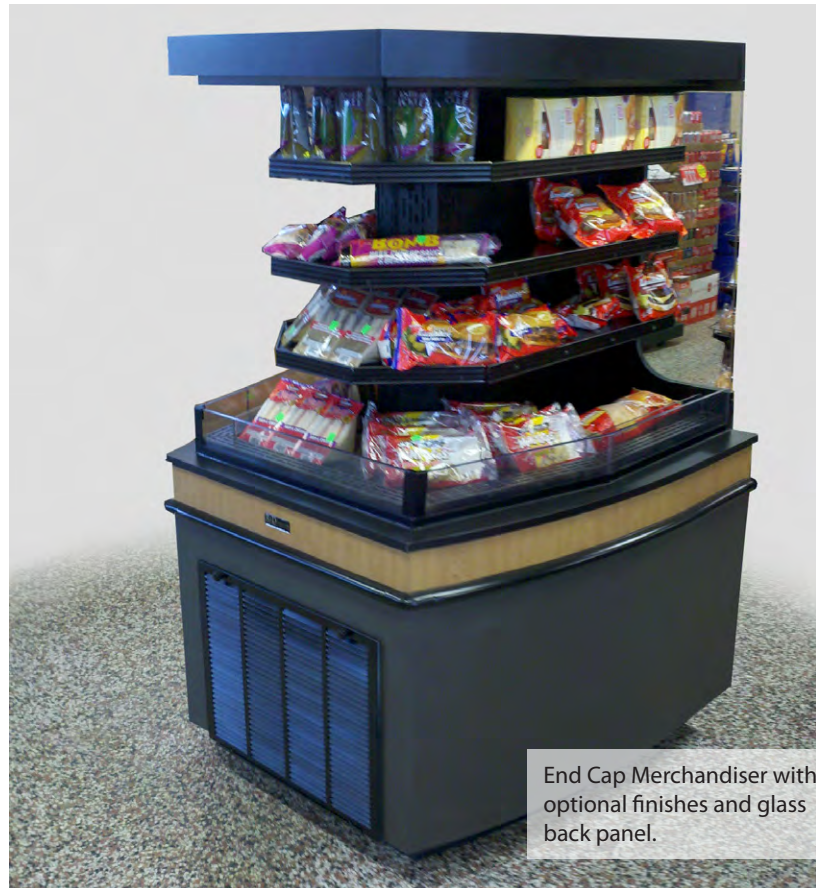
End Cap Merchandiser with optional finishes and glass back panel.