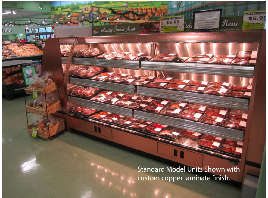
Standard Model Units Shown with custom copper laminate finish.